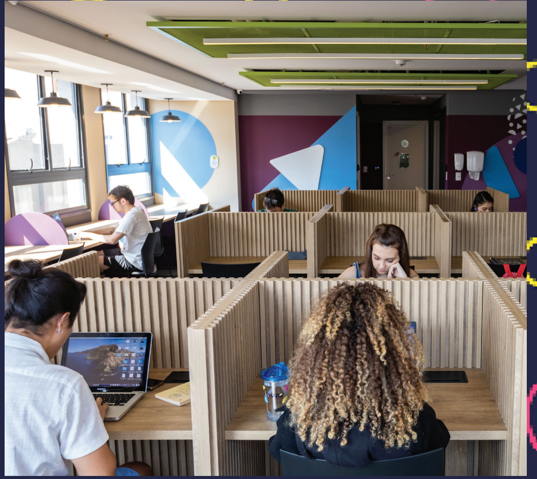
24-hour studying and coworking room